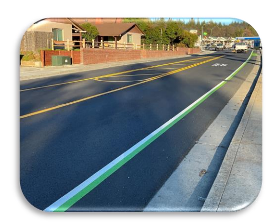
Broadway Sidewalks Project – New Sidewalk and Retaining Walls

https://www.cityofplacerville.org/capitalimprovement-projects